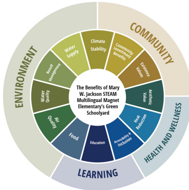
Figure 1. The Benefits of Schoolyard Greening: Earth Economics' Areas of Analysis

Earth Economics also explored the potential benefits to the community from opening the playground to the public during non-school hours. If an additional 556 community members were to exercise one day per year at the school, the benefits of that increased physical activity would be equal to the annual cost to operate and maintain the playground. In other words, the annual cost of maintaining the playground would be justified even if the park was open to the public only one day per month—as long as at least 46 visitors used the park that day to engage in moderate to vigorous physical activity.