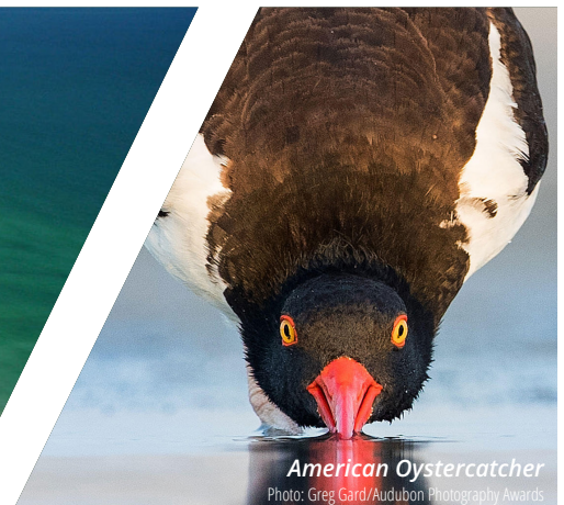
American Oystercatcher