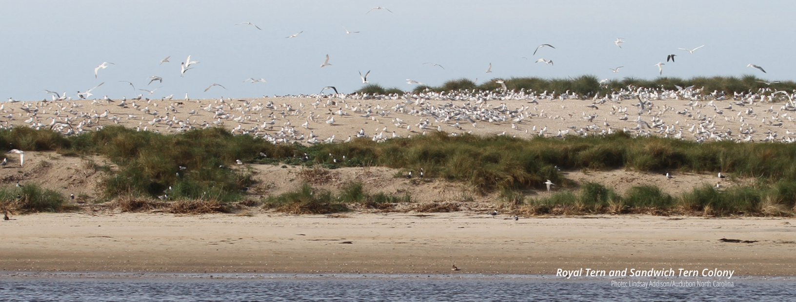
Royal Tern and Sandwich Tern Colony

Clearly, investing in efforts to restore and preserve these important habitats will deliver significant economic value to the region. The projects are also expected to enhance community well-being by providing opportunities for residents to connect with nature through volunteer and coastal stewardship activities, birdwatching, kayaking, hunting, and fishing. This suite of projects demonstrates a cost-effective strategy for building ecological and community resilience to sea-level rise and other climate impacts.