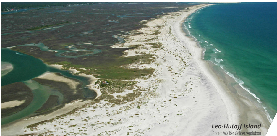
Lea-Hutaff Island

storms are among the top threats to the region, which has seen 11 inches of sea-level rise since the 1950s. 2 More intense coastal storms have eroded habitats and caused loss of human life and damage to infrastructure. Since 2016, this region has experienced three major storms – hurricanes Matthew in 2016, Florence in 2018, and Dorian in 2019. These hurricanes caused heavy rainfall and storm surges that overflowed the Cape Fear River, damaging homes and businesses, making roads impassable, and causing widespread power outages from Bald Head Island to Wilmington and beyond. Marshes throughout the estuary enhance natural flood protections for low-lying communities along the banks of the Cape Fear River, and barrier islands along the Atlantic Coast protect communities on the mainland from damaging coastal storm surges.