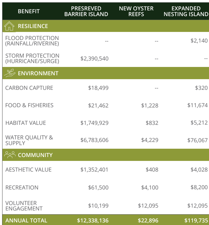
Table 1. Annual benefits from the Projects.

Additionally, acquisition and protection of Lea-Hutaff Island will not only preserve important habitats for shorebirds like the Wilson's Plover and Least Terns, but it will also preserve the first line of defense for the mainland during coastal storms. Preserving this valuable natural barrier will deliver more than $12.3 million in annual economic benefits to the region and over $278 million in total economic benefits over a 35-year period (assuming a 3% discount rate).